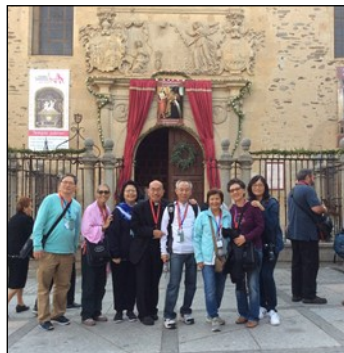
Church of St. Teresa of Avila