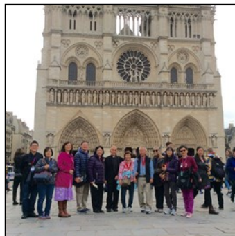
Notre Dame, Paris