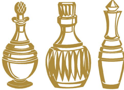
OIL OF THE SICK

At this annual Eucharist, the bishop blesses the oils that will be used in the celebration of the sacraments throughout the diocese during the coming year: the Oil of Catechumens used in Baptism, the Oil of Chrism used in Baptism and Confirmation, and the Oil of the Sick used when sick people request the healing power of