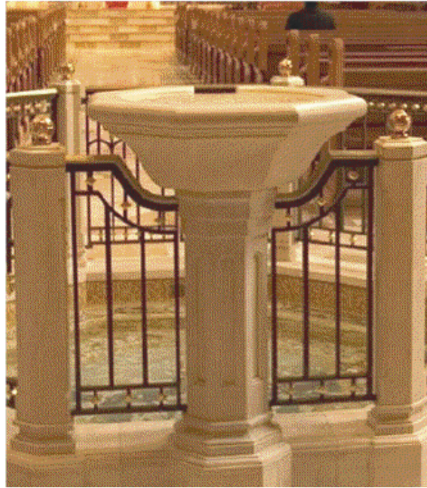
Cathedral Baptismal Font

The water in the font circulates through a filtering system in the lower level that involves two purification stages: it passes through a filter that takes out the dirt, and it passes through an ultraviolet light mechanism that kills all germs. Parishioners should have no concerns, therefore, as they bless themselves with that water.