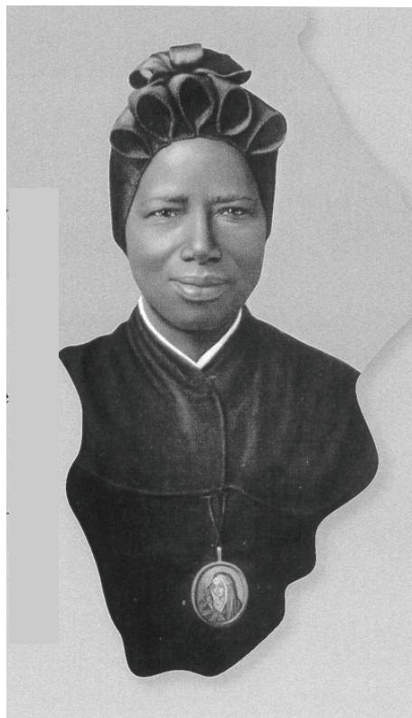
SAINT JOSEPHINE BAKHITA

On Saturday, February 11, at 9:00 am, the "Call for Action in Darfur" will be held at Immaculate Conception Parish, located at Broadway and 1st Avenue.