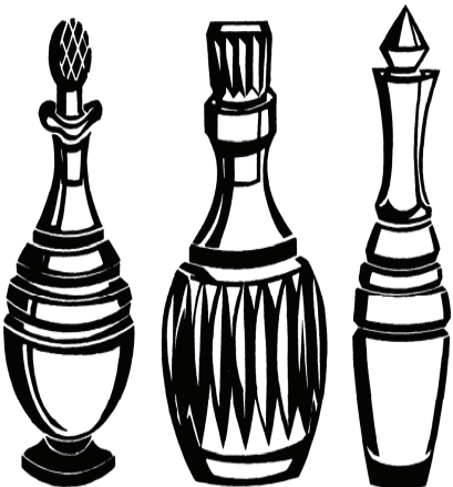
OIL OF THE SICK OIL OF THE CATECHUMENS SACRED CHRISM

The Chrism Mass is one of the most important Diocesan celebrations of the year.